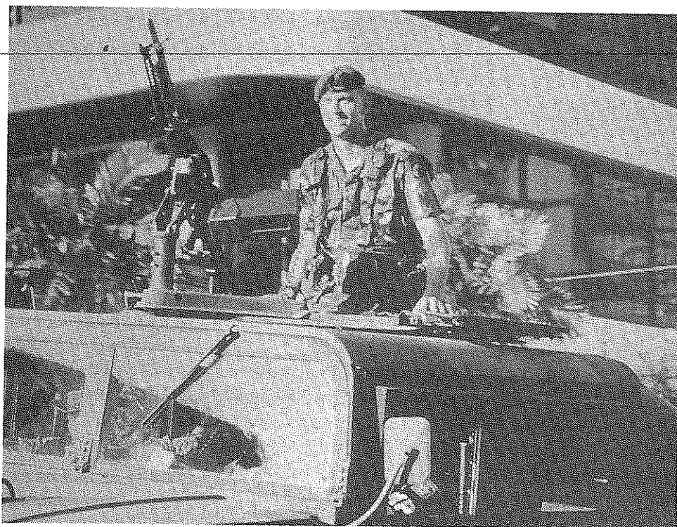
XVIII Airborne Corps

MPs proved again during Operation Just Cause that they are well-suited to fill a variety of roles in contingency operations.