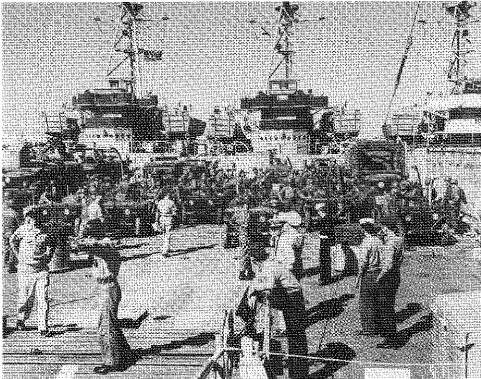
Port Everglades, Florida, 12 November 1962: Equipment of the 1st Armored Division is loaded aboard Navy ships for maneuvers during the Cuban missile crisis.

At this point, the forces controlled by CINCLANT went into a kind of suspended animation, waiting for an execution order that never came. The