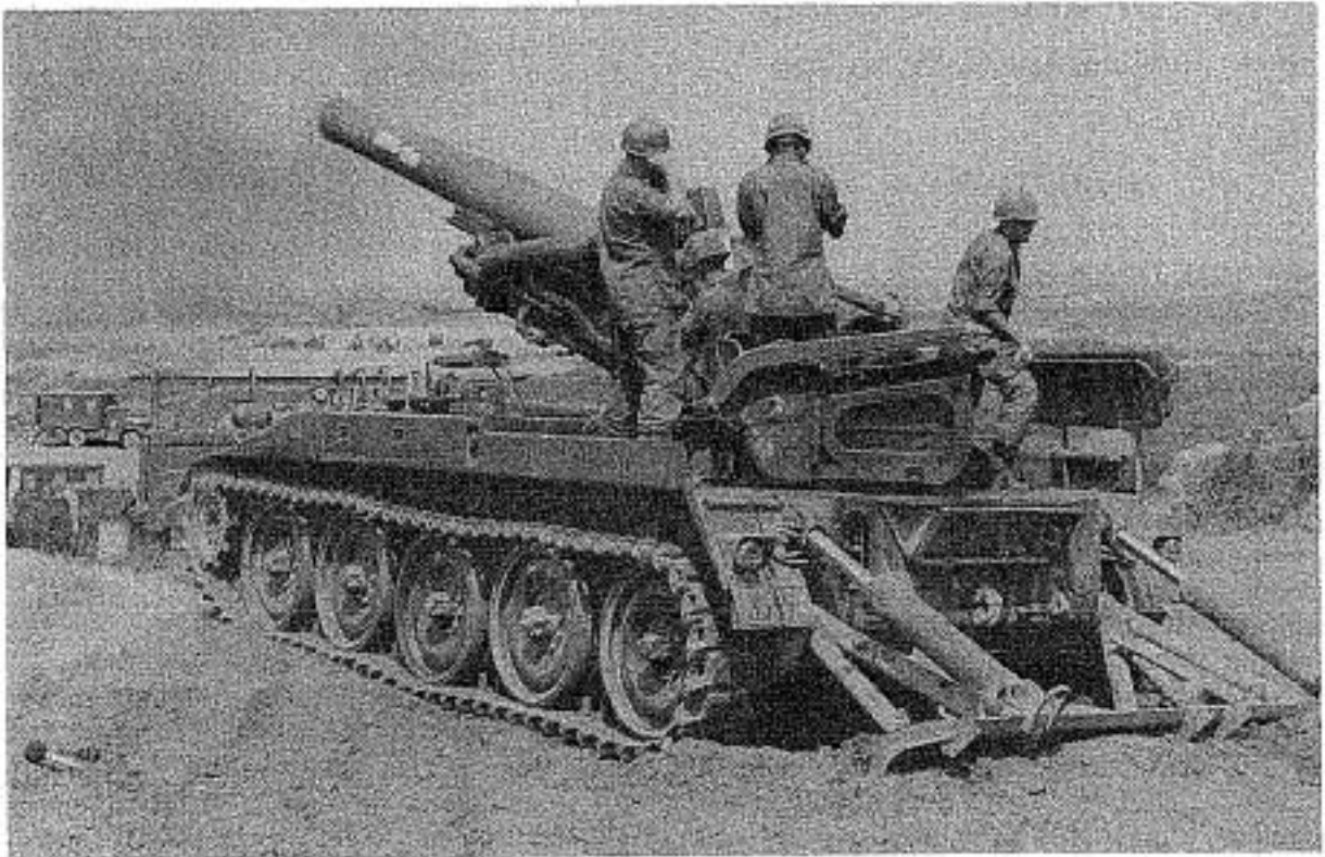
An artillery gun crew firing against the Viet Cong.

But the important contribution of The Uncertain Trumpet was its presentation of a program intended to correct the deficiencies of Massive Retaliation; a program Taylor called "Flexible Response." He explained that the label Flexible Response was intended to suggest "... the need for a capability to react across the entire spectrum of possible challenge, for coping with anything from general atomic war to infiltrations..." He justified the requirement for such a broad capability on the basis that "... it is just as necessary to deter or win quickly limited wars as to deter general wars" lest limited wars result "... in our piecemeal attrition or involvement in an expanding conflict which may grow into the general war we all want to avoid." 17