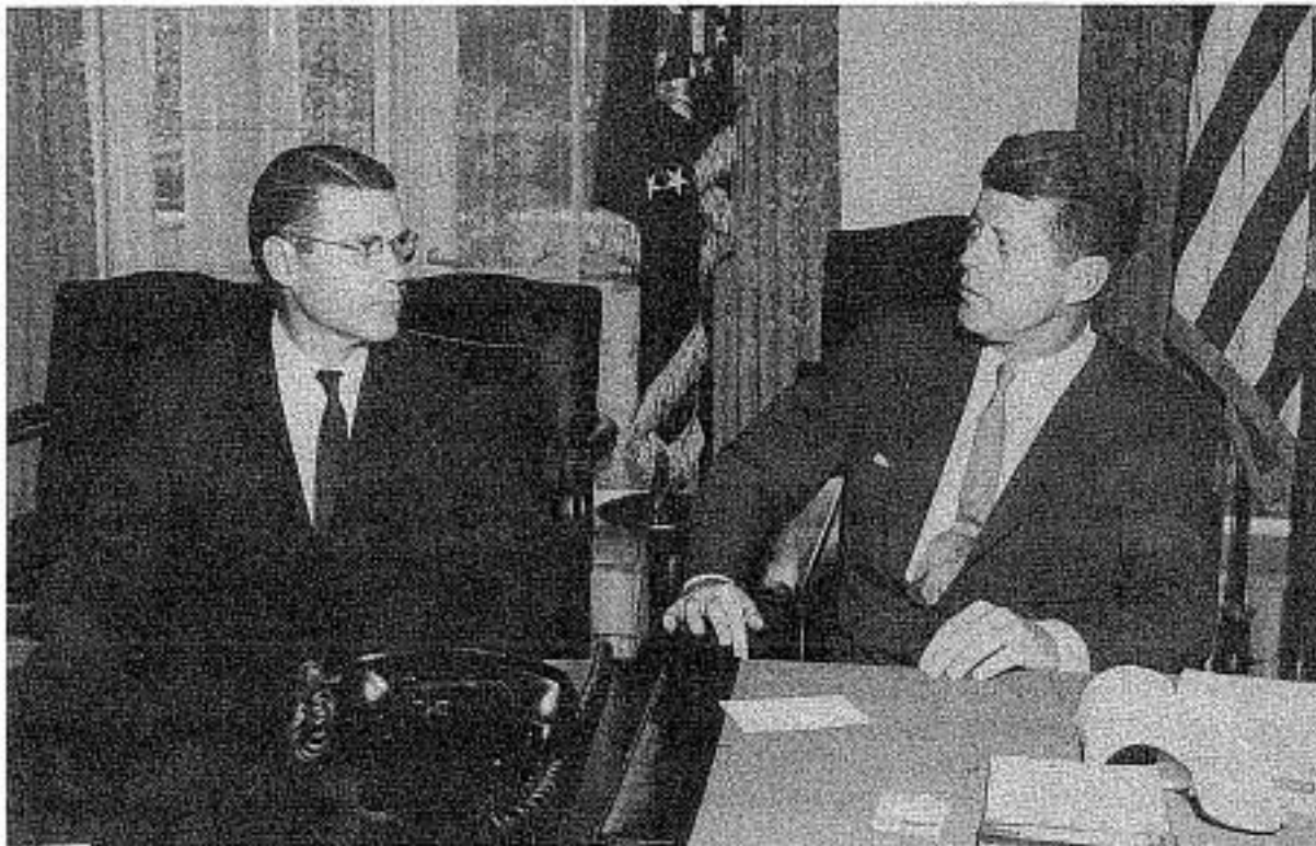
President John F. Kennedy and Secretary of Defense Robert S. McNamara following a cabinet meeting at the White House.

In the final analysis, whether one uses Taylor's proposals of 1958 or what McNamara seemed to be saying by the mid-1960s, the basic philosophy of Flexible Response toward strategic nuclear weapons is that their possession in adequate numbers is vital, yet they have little utility in terms of