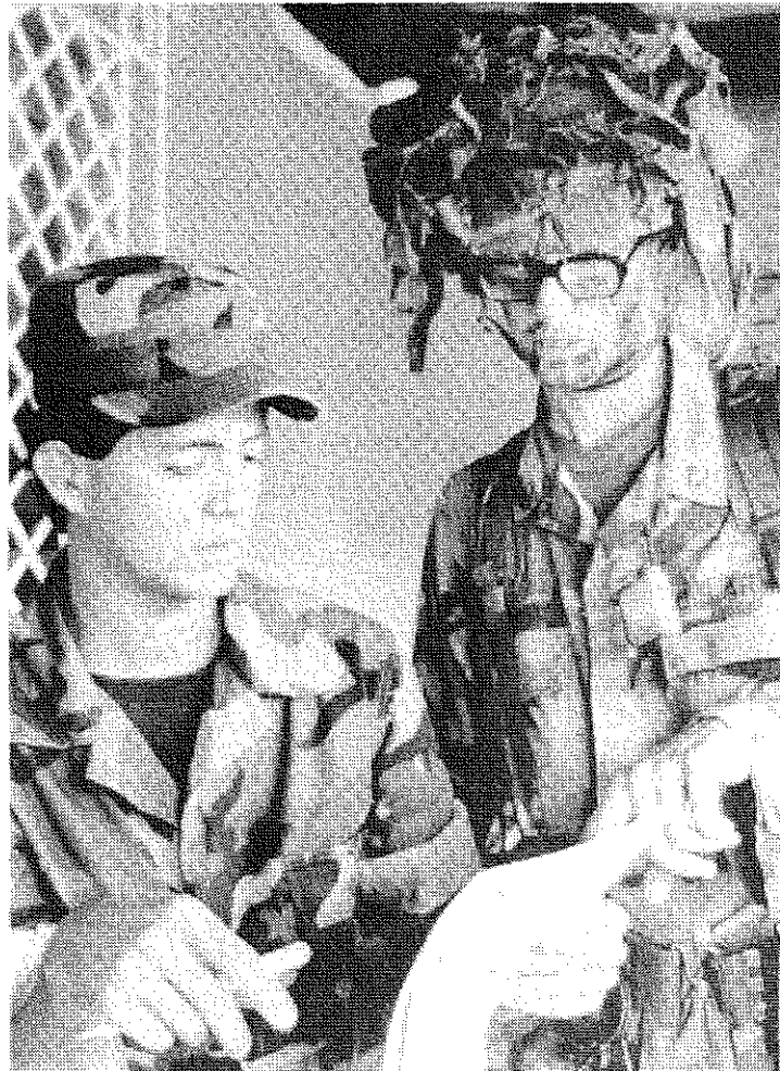
7th Inf Div (Light) PAO

C Company's third week in Panama City signaled yet another change in the mission, with its soldiers becoming role models for their Panamanian counterparts. Gradually, the US Army began to transfer policing authority back to the Panamanians. Combined Panamanian/US patrols were conducted. Soldiers were instructed to conduct themselves in a manner beyond reproach,